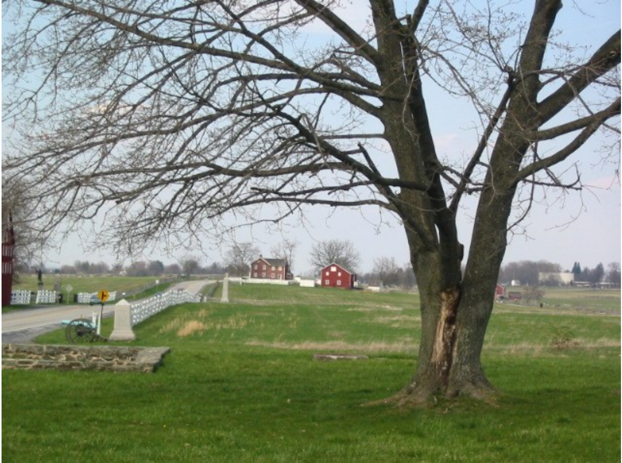
Klingel House and barn (red) in far rear. At right is the Peach Orchard.