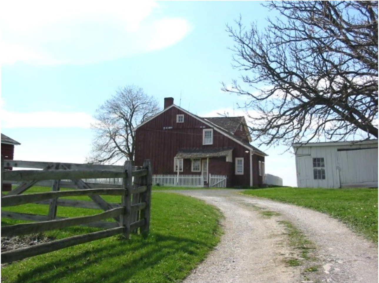
2004 rear view of the Klinge House at Gettysburg PA. The Union NJ 11th regiment laid down in the driveway area, the high ground, waiting for the Confederates.