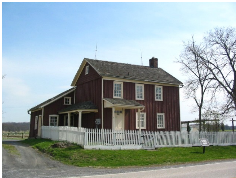
Klingel House front yard. The battle with take place to the photo right side, about 70 yards down.