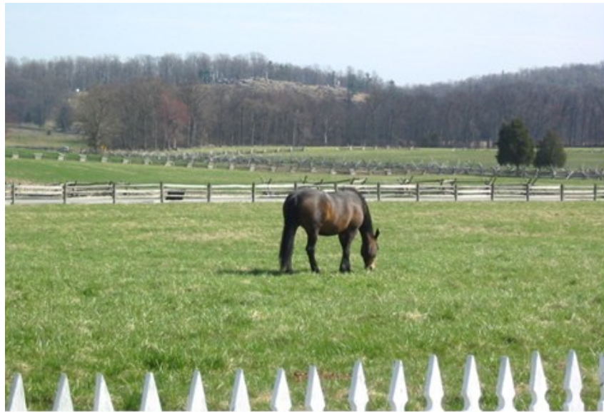
Pasture on left side of the Klingel House. Little Round Top in far rear.