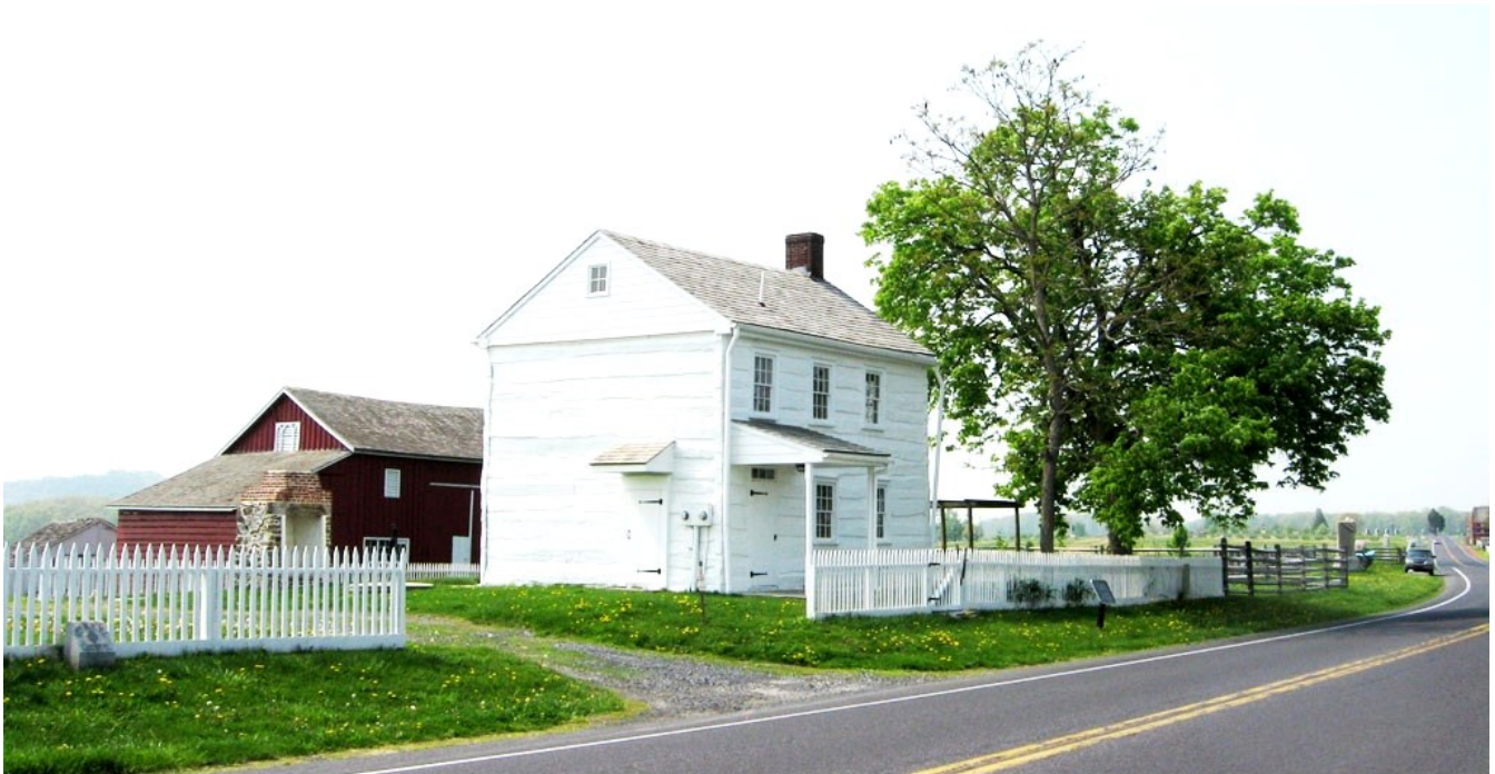
Klingel House at Gettysburg PA. The NJ 11th battled near the car.