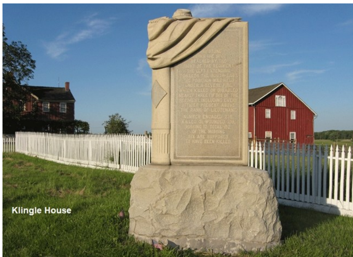
NJ 11th monument at Gettysburg