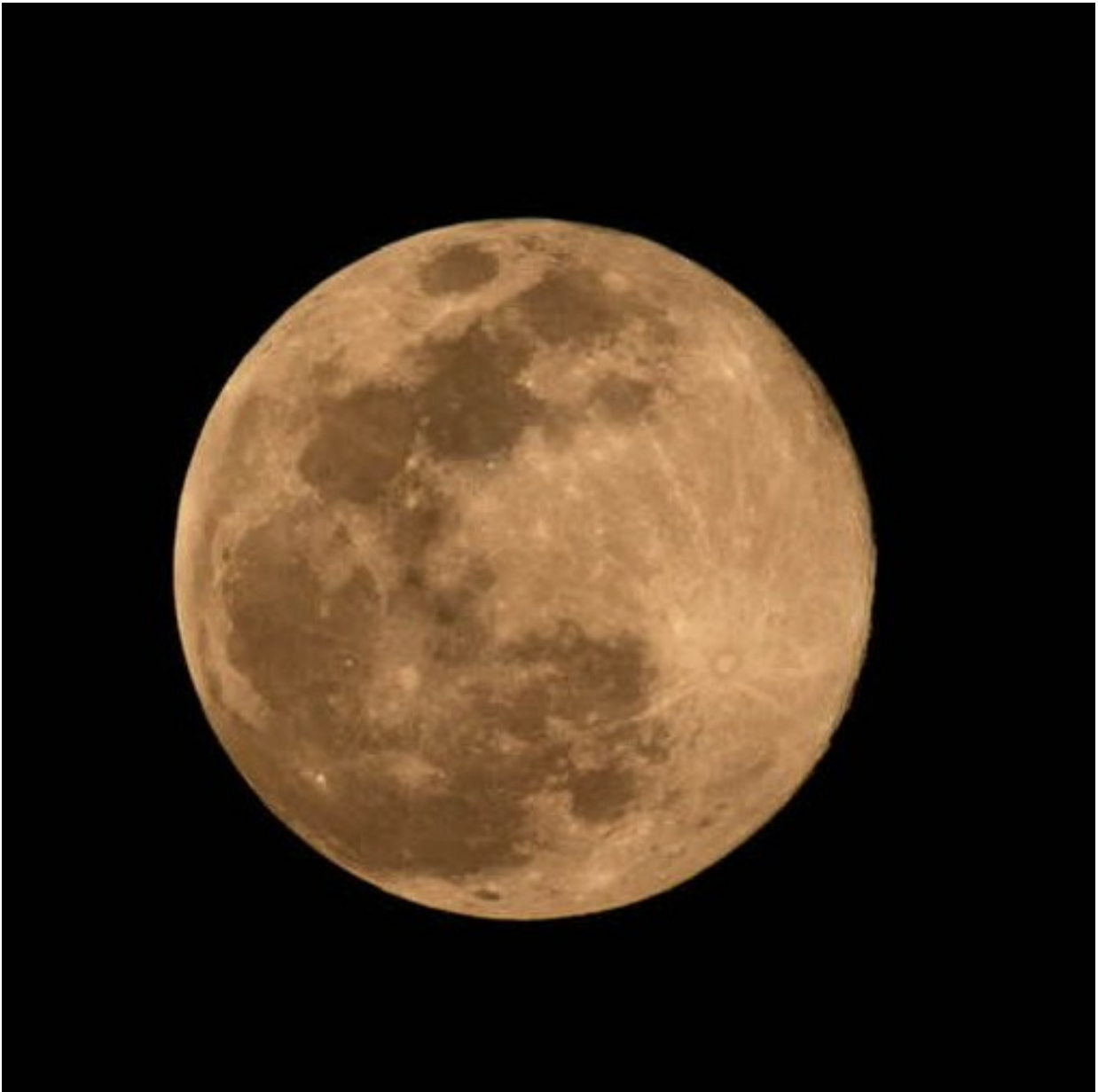
Pink Moon photo by Gene Pearce.