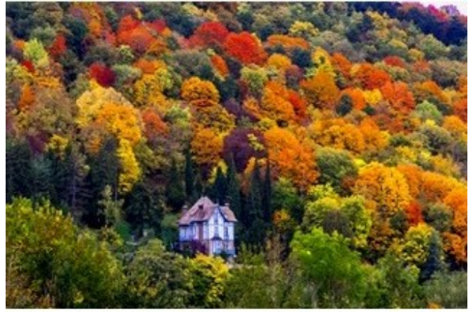
Siene River, France 2015