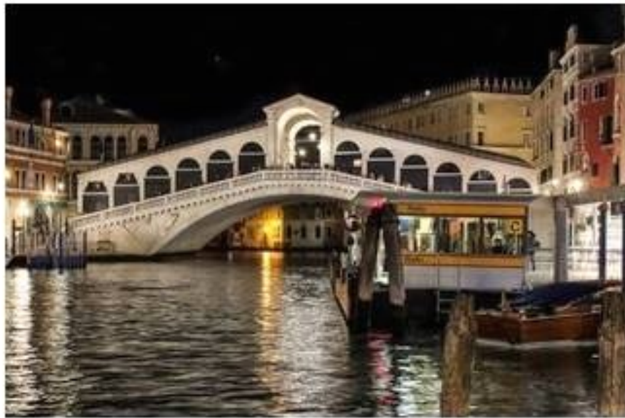
Gene: Fall 2016: The Rialto Bridge at night.