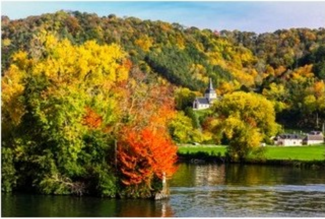
Siene River, France 2015