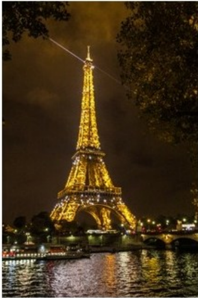
Eiffel Tower Paris, France