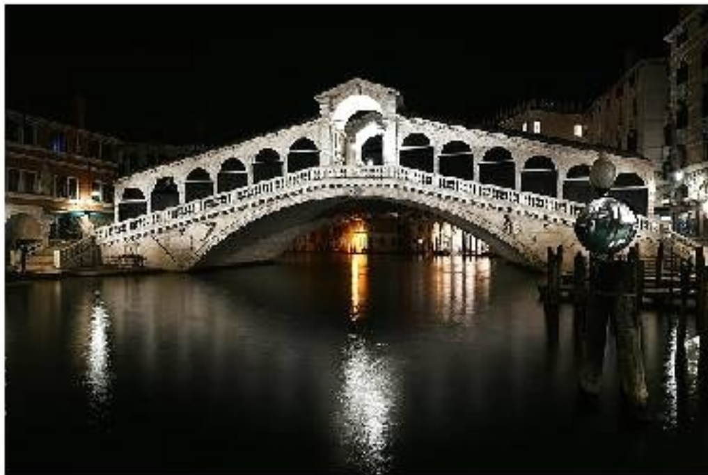
Wikipedia photo, not as nice as Gene's.