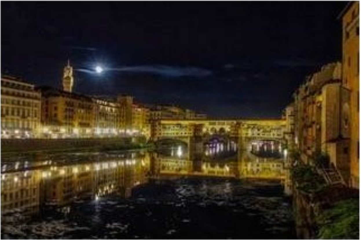
The Ponte Vecchia Bridge over the Arno River in Florence. The moon was basically full.