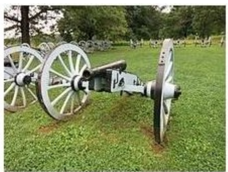
Cannons dragged thru mud and woods.