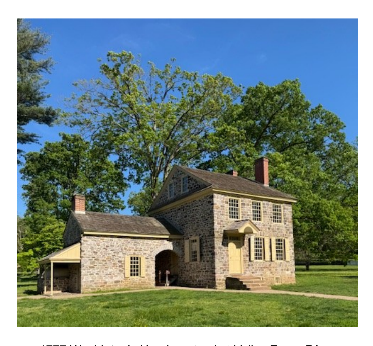
1777 Washinton's Headquarters' at Valley Forge PA.2025