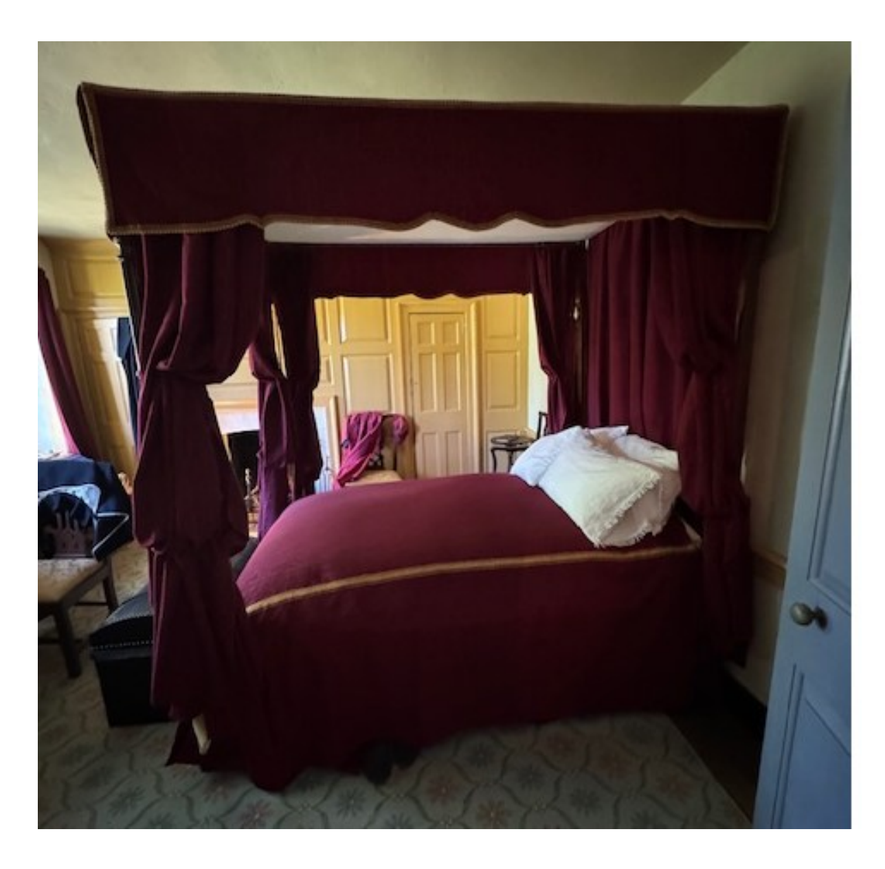
2025 photo by Jane Fisk Pierce. Washington's bedroom.