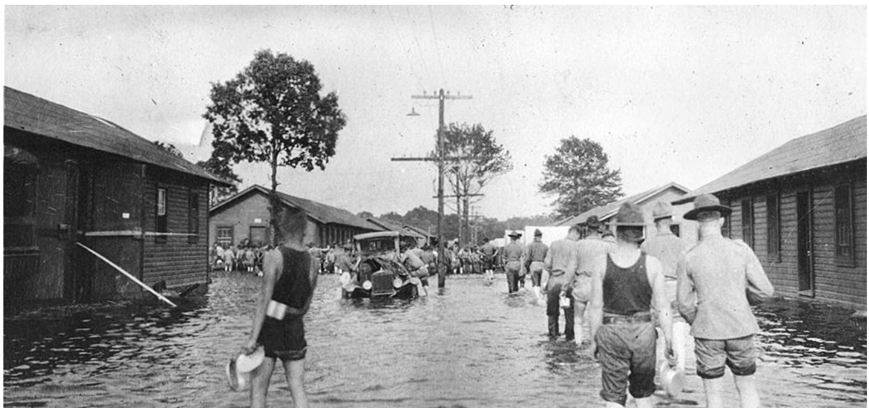
1918 Navy Rifle Range barracks, Fairfield NJ