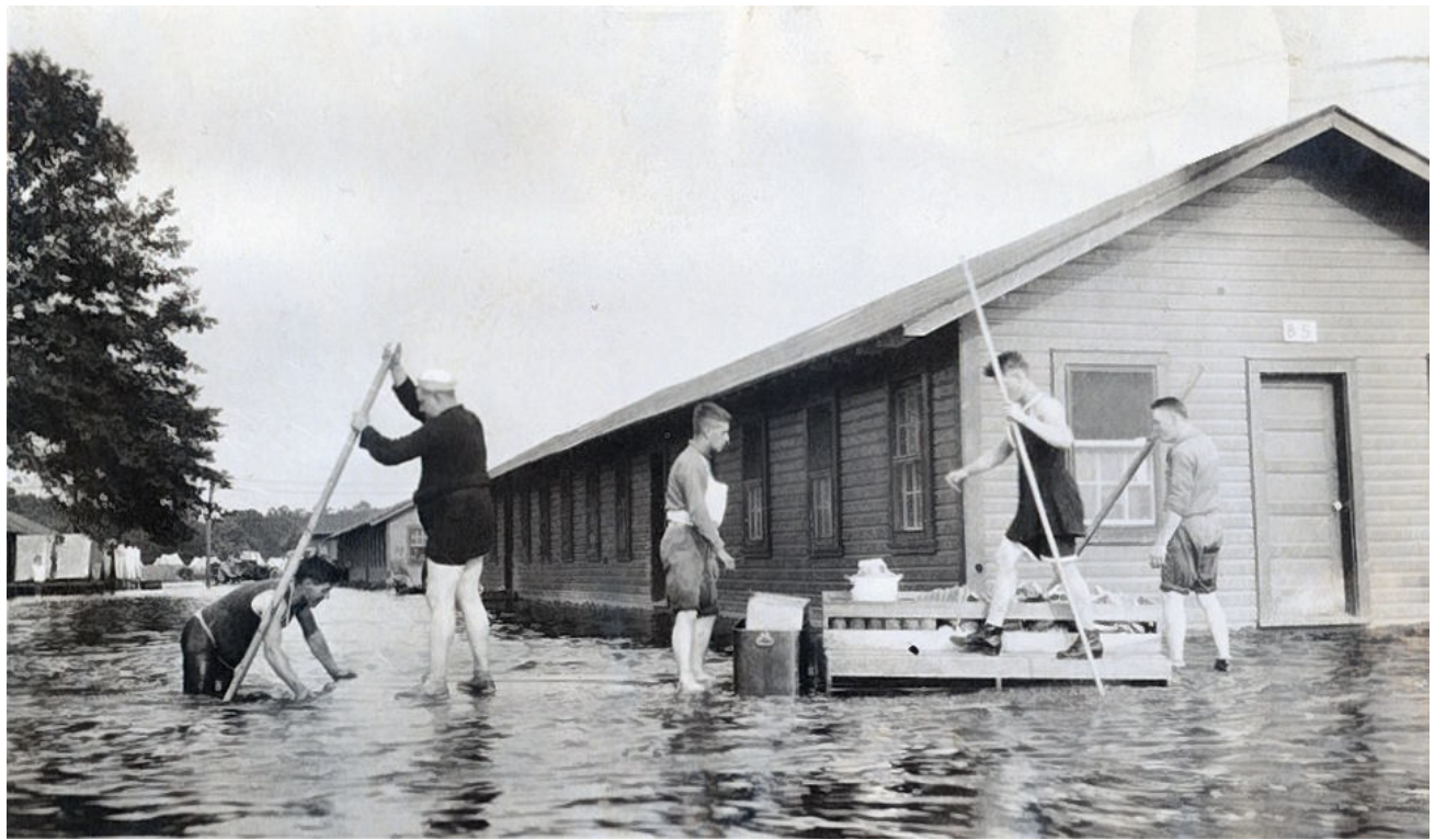
1918 Rifle Range, Horseneck Road, Fairfield NJ