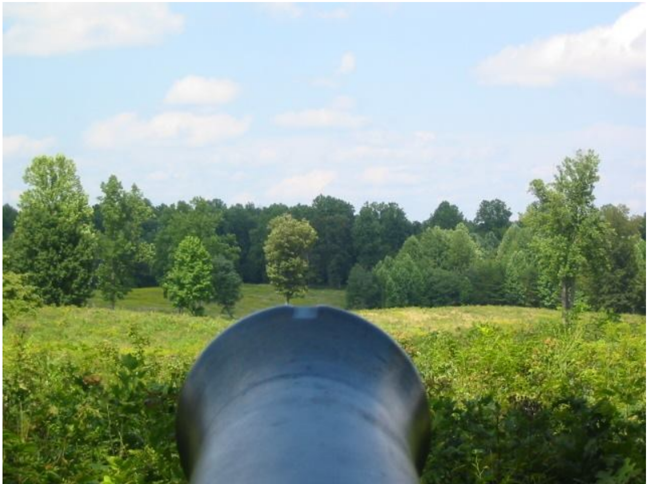
Glen photo 2005. Confederate cannon pointing towards far away woods where Joe Baldwin fell.