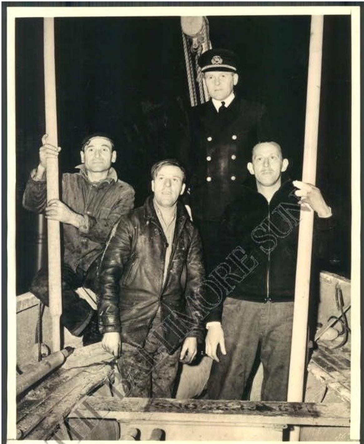
SS Schodack Crew - October 1923 Baltimore Sun Newspaper.